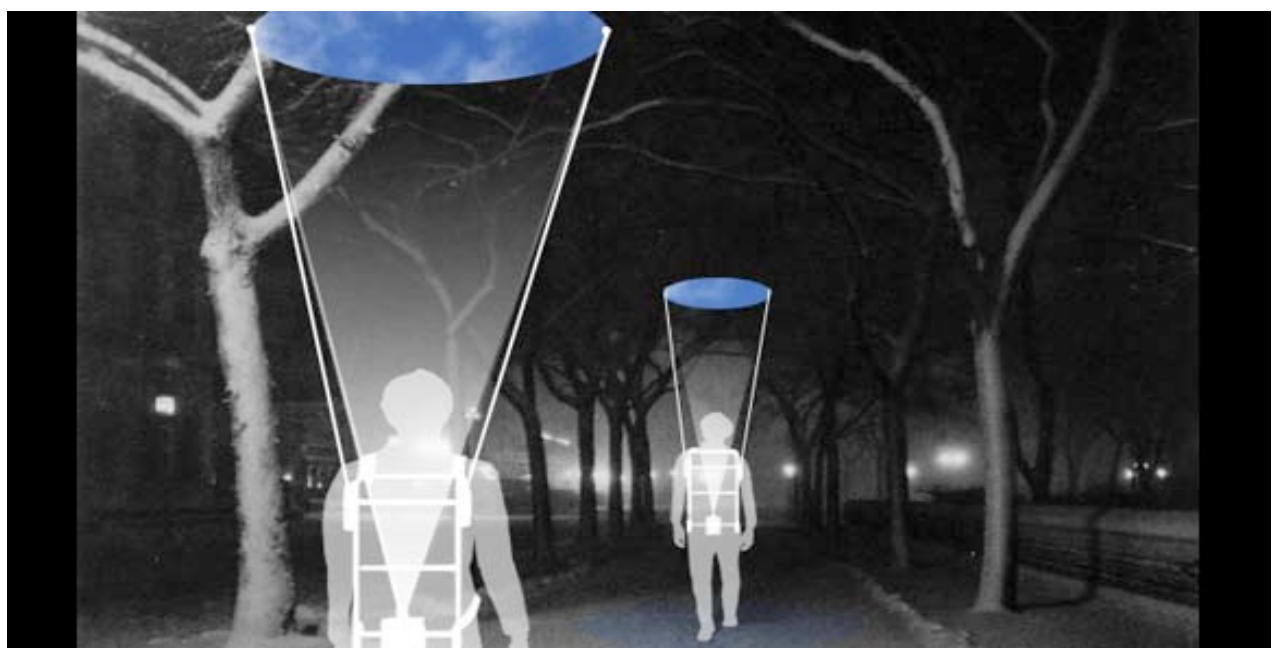
Peter Russell, Skylight, interactive visual-performance